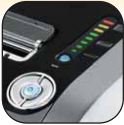
Usage indicators showing shredder capacity