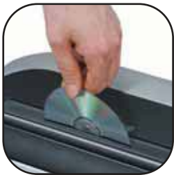
Safely shreds CDs