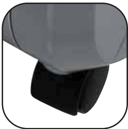
Castors with brakes