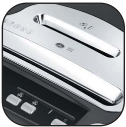
Separate throat & waste bin for CDs