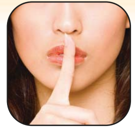
Ultra quiet operation