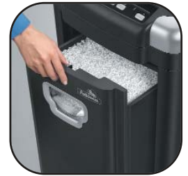
High capacity removable bin