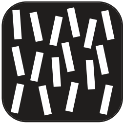
(2 x 8 mm actual size) Shreds 1 sheet of A4 paper into 3898 pieces