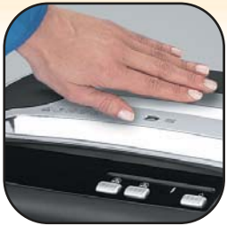
Safe Sense™ technology